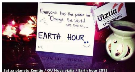
Sat za planetu Zemlju / OU Nova vizija / Earth hour 2015